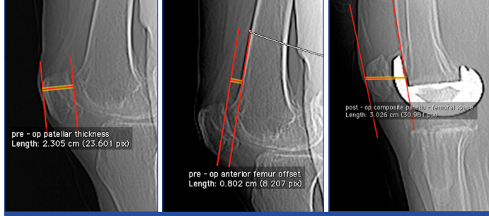
[Table/Fig-3]: Preoperative PT, Distance between anterior and posterior cortex of patella. [Table/Fig-4]: Preoperative AFO, Maximum anterior thickness of distal femur beyond the anterior femur cortical line. [Table/Fig-5]: Postoperative PFC, Distance between anterior cortex of patella and anterior femur cortical line.