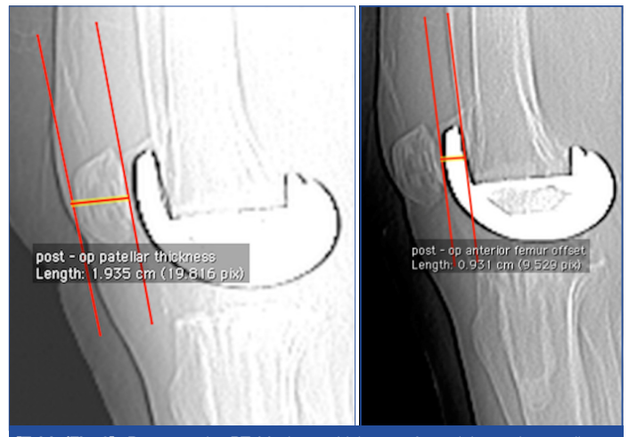
[Table/Fig-6]: Postoperative PT, Maximum thickness of remaining native patella and thickness of patellar button. [Table/Fig-7]: Postoperative AFO, Thickness of the anterior flange of the femur component of the TKA implant.